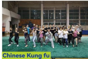
Chinese Kung fu