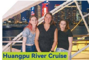
Huangpu River Cruise

Experiencing something and hearing about something are totally different! Abundant cultural activities enable students to experience the Chinese culture and traditions, to achieve multicultural understanding and establish a global vision.