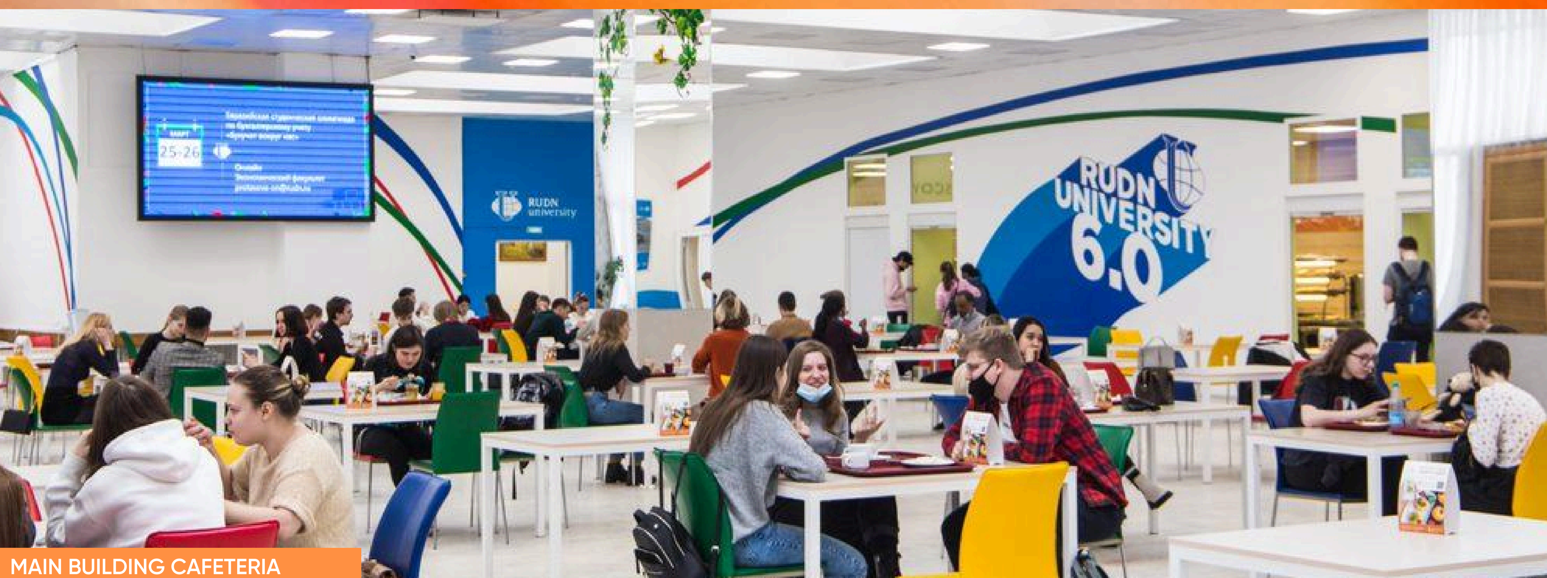
MAIN BUILDING CAFETERIA

A VARIETY OF HOT MEALS, SNACKS, AND BEVERAGES ARE OFFERED DAILY AT REASONABLE PRICES (AVERAGE MEAL COST: 250–400 RUB) PARTICIPANTS ARE RESPONSIBLE FOR COVERING THEIR OWN MEAL EXPENSES DURING THE PROGRAM.