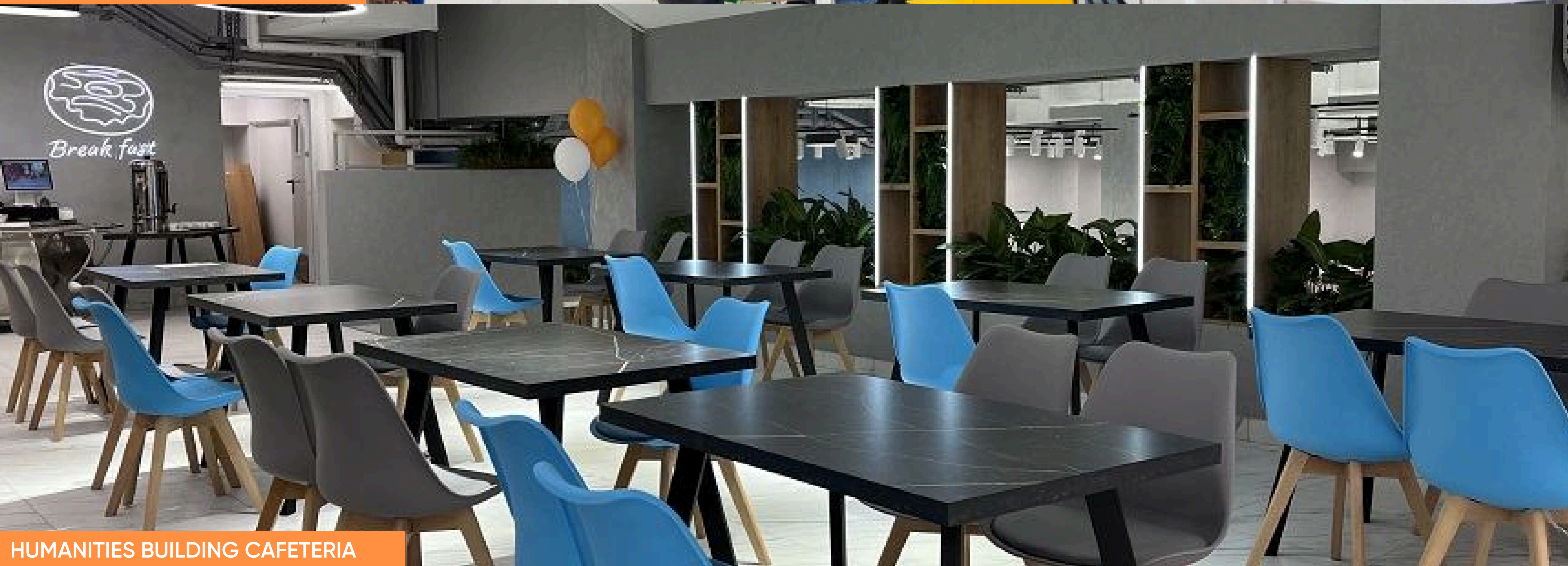
HUMANITIES BUILDING CAFETERIA